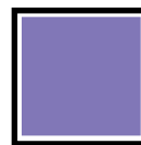
Mat (tile) system